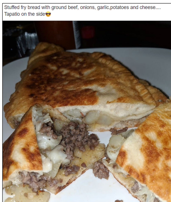
Figure 2. A Facebook Post Dated January 8, 2019, in a Group Called “Fry Bread Factory,” Described as a Page “Created for the 7th Generation and All Our Relations”

One of the prime areas of current health research in American Indian communities is diet. Story et al. (1999) state, “Obesity has become a major health problem in American Indians only in the past 1-2 generations and is believed to be associated with a relative abundance of high-fat foods and the rapid change from active to sedentary lifestyles” (Story et al., 1999, p. 747S). The study described the dietary practices that were identified as contributing to obesity. These included the consumption of butter, lard, whole milk, fry bread, fried meats and vegetables, and the generous use of fat in beans (Story et al., 1999). Not coincidentally, the foods mentioned are the same foods provided for in the 1776 army ration box and were the same foods used to feed students in American Indian boarding schools. The diet of the American Indian boarding school was so ingrained because of acculturation that students returning home took those taste preferences and dietary practices into their community, leaving taste preferences and dietary practices that have lasted for generations.